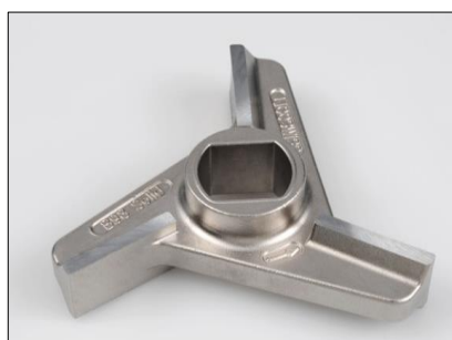
Knife B98 Solid