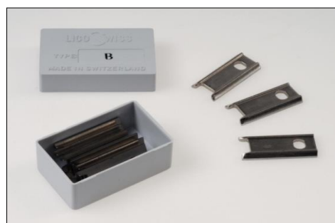
Spare blades B98