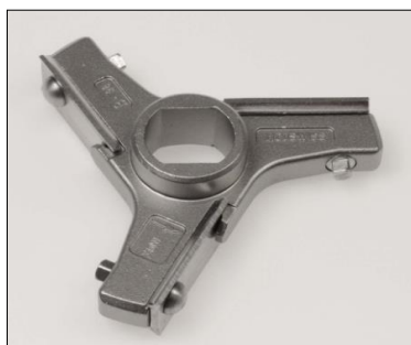
knife B98, 3 wings