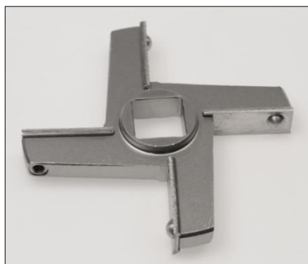
Knife No.42/52 with blades