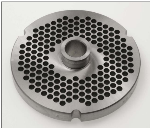
Plate with hub