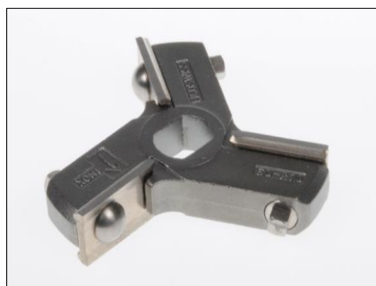
Knife SO/R70 without bush