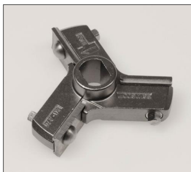
Knife SO/R70, 3 wings, inox