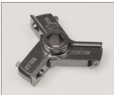
Knife SO/R70 with blades